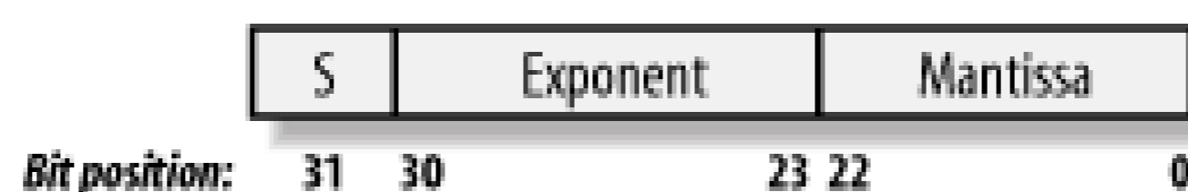
Figure 1-2. IEEE storage format for the 32-bit float type

The sign bit S has the value 1 for negative numbers and 0 for other numbers. Because in binary the first bit of the mantissa is always 1, it is not represented. The exponent is stored with a bias added, which is 127 for the float type.